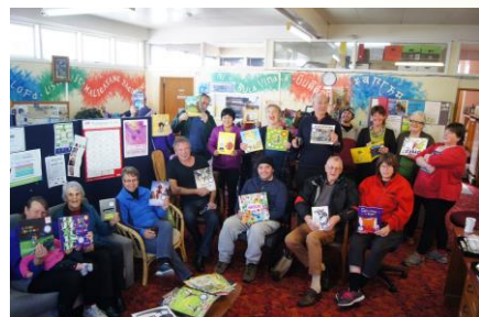
Literacy North Otago