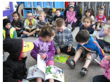
Taranaki Adult Literacy Services