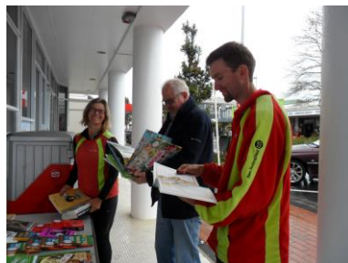
Adult Literacy Franklin