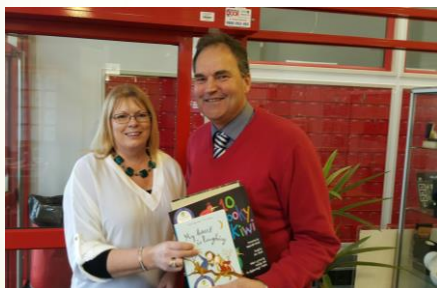
Buller /West Coast Adult Learning