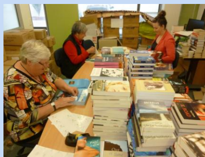
The labelling of 4200+ books begins