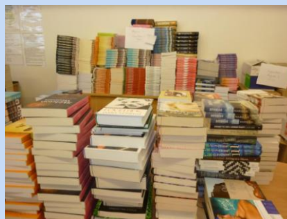
Stacked and counted per region