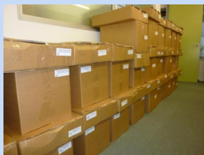
Ready and packed for distribution to Ngā Poupou our member providers